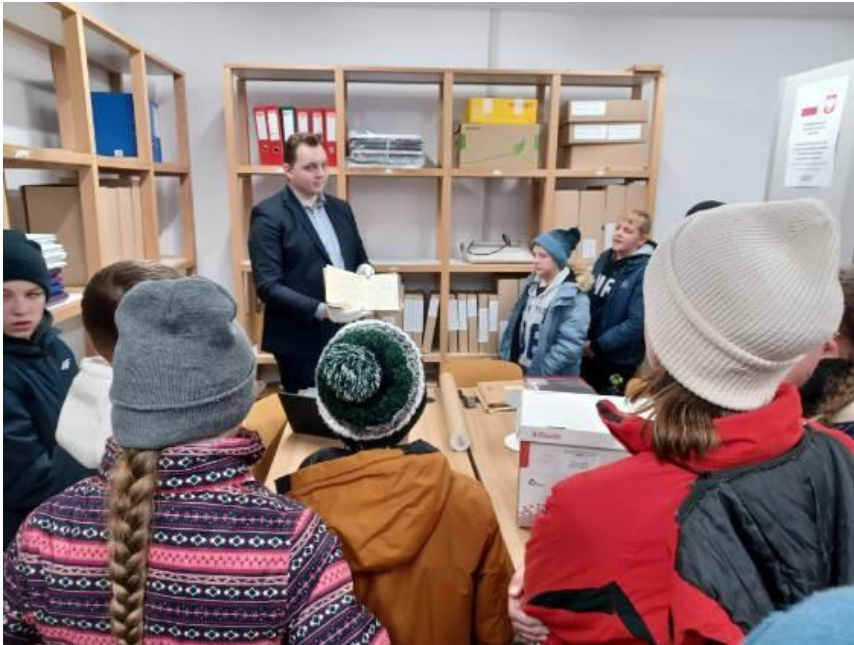
Children visiting the GMRC's archive. GMRC on Facebook, 17.12.2024,

https://www.facebook.com/fzentrum/posts/pfbid046LSLBVJutYZ7xPfl142VcnSVnfTwMfvm4A5NtxWGLeMMbsNVsSkUUGMbveEaW