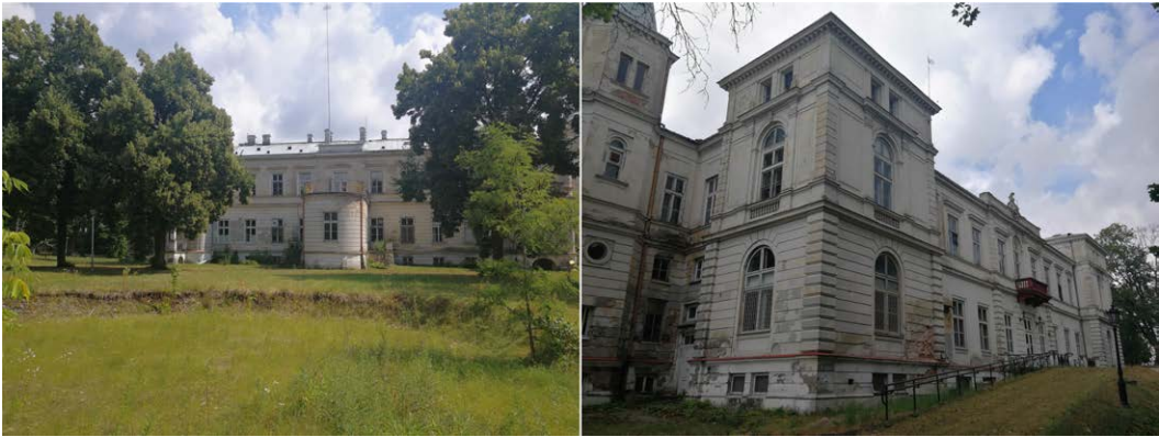
Pict. 1: The Kronenbergs' Palace in Wieniec (on the left is a part of the eastern elevation, on the right, part of the western elevation)