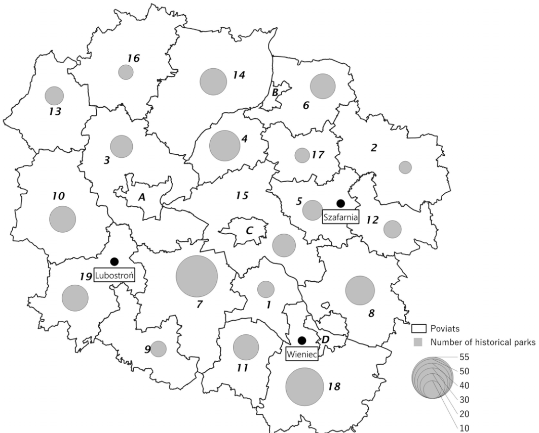
Fig. 1: Number of PPCs in Kujawsko-Pomorskie Voivodeship in 2018 by poviats