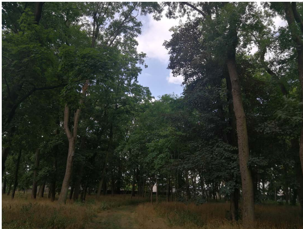
Pict. 2: Historical park in Wieniec around the Kronenbergs' Palace