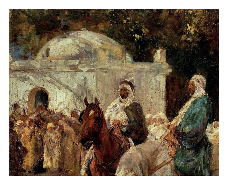
Fig. 13. Alfred Wierusz-Kowalski, Przed meczetem ["In front of the mosque"], after 1903, oil on canvas, 47 x 62 cm, private property, fragment.