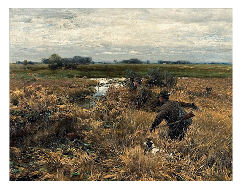
Fig. 3. Alfred Wierusz-Kowalski, Myśliwi w sitowiu ["Hunters in the bulrush"], after 1892, oil on canvas, 44,5 x 56,5 cm, private collection.