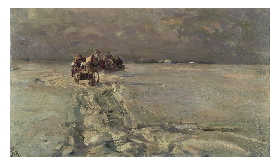
Fig. 10. Alfred Wierusz-Kowalski, Sanna ["Sleigh ride"], ca. 1890–1900, oil on panel, 28 x 48 cm, Muzeum Okręgowe w Suwałkach. Photo by Adam Cupa

Fig. 9. Alfred Wierusz-Kowalski, Dwa wilki ["Two wolves"], ca. 1910, oil on cardboard, 25 x 31 cm, Muzeum Okręgowe w Suwałkach. Photo by Adam Cupa