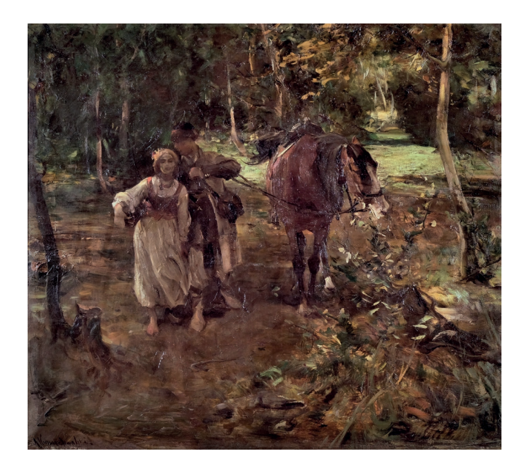
Fig. 11. Alfred Wierusz-Kowalski, Zakochani ["In love"], undated, oil on canvas, 81,5 x 91,5 cm, fragment, Muzeum Sztuki w Łodzi [Museum of Art in Łódź]. Photo by Adam Cupa