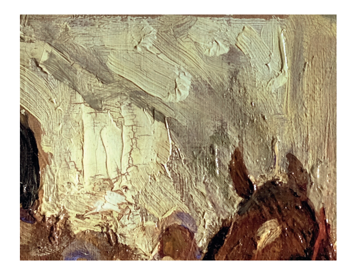
Fig. 14. Alfred Wierusz-Kowalski, Przed meczetem ["In front of the mosque"], after 1903, oil on canvas, 47 x 62 cm, private property, fragment. Visible paint texture typical of a flat bristle brush and painting spatula. Photo by Adam Cupa

Fig. 13. Alfred Wierusz-Kowalski, Przed meczetem ["In front of the mosque"], after 1903, oil on canvas, 47 x 62 cm, private property, fragment. Photo by Adam Cupa