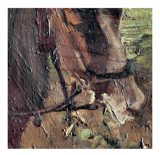
Fig. 12. Alfred Wierusz-Kowalski, Zakochani ["In love"], undated, oil on canvas, 81,5 x 91,5 cm, fragment, Muzeum Sztuki w Łodzi. Noticeable textural study of the preliminary painting work, whose sketch does not overlap the final composition of the painting. Photo by Adam Cupa

Fig. 11. Alfred Wierusz-Kowalski, Zakochani ["In love"], undated, oil on canvas, 81,5 x 91,5 cm, fragment, Muzeum Sztuki w Łodzi [Museum of Art in Łódź]. Photo by Adam Cupa