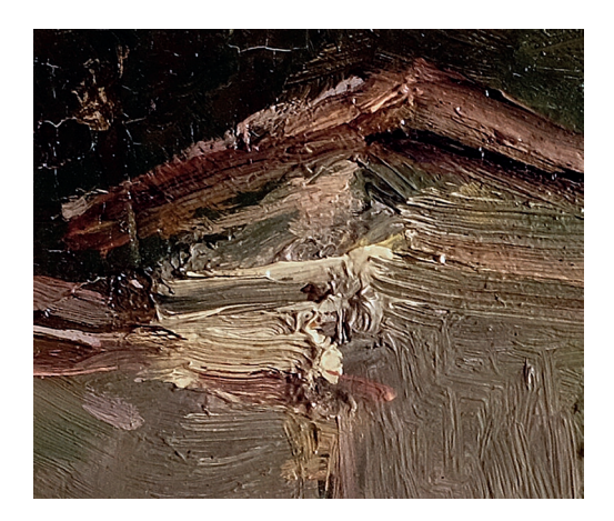
Fig. 16. Alfred Wierusz-Kowalski, Postój powstańca ["Insurgent resting"], ca. 1892–1895, oil on panel, 20 x 35 cm, fragment, Muzeum Okręgowe w Suwałkach, a gift of the artist's family. Noticeable brown underpainting in the preliminary study. Visible paint texture typical of a bristle brush. Photo by Adam Cupa

Fig. 15. Alfred Wierusz-Kowalski, Postój powstańca ["Insurgent resting"], ca. 1892–1895, oil on panel, 20 x 35 cm, fragment, Muzeum Okręgowe w Suwałkach, a gift of the artist's family. Noticeable brown underpainting in the preliminary study as well as distinguished work with a brush and spatula. Photo by Adam Cupa