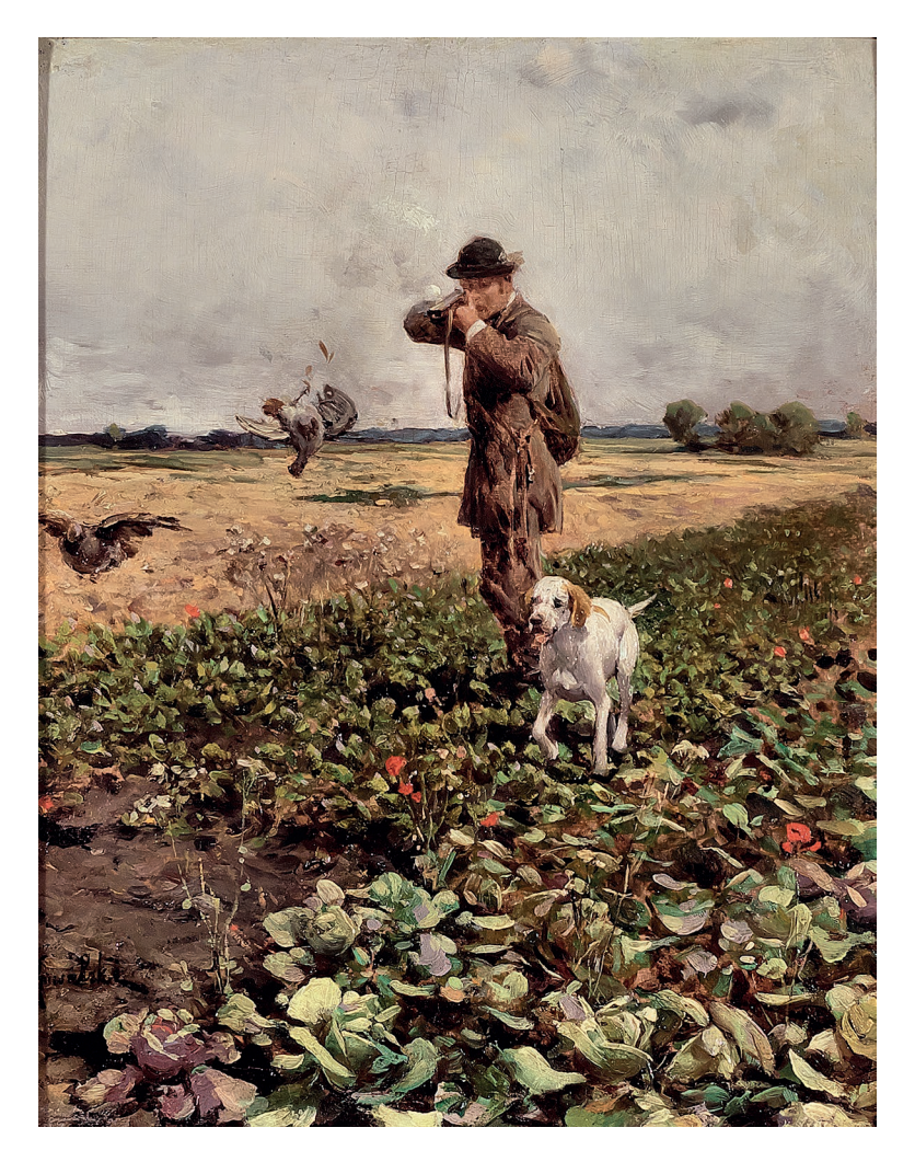
Fig. 5. Alfred Wierusz-Kowalski, Na polowaniu ["Hunting"], ca. 1880, oil on panel, 28 x 22 cm, Muzeum Okręgowe w Suwałkach.