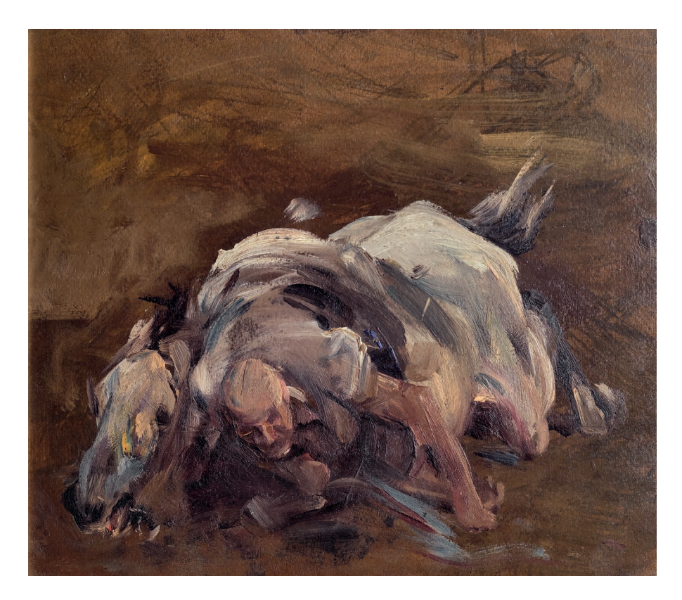
Fig. 8. Alfred Wierusz-Kowalski, Ranny Tatar padający z koniem ["Wounded Tatar falling down with a horse"], ca. 1910, oil on cardboard, 27 x 32 cm, Muzeum Okręgowe w Suwałkach.