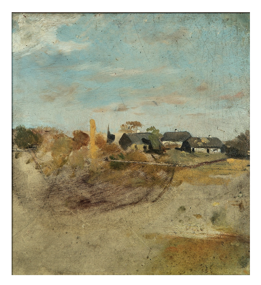
Fig. 6. Alfred Wierusz-Kowalski, Domy na łąkach ["Houses in the Meadows"], ca. 1880, oil on board, 18 x 16 cm, Muzeum Okręgowe w Suwałkach. Photo by Adam Cupa