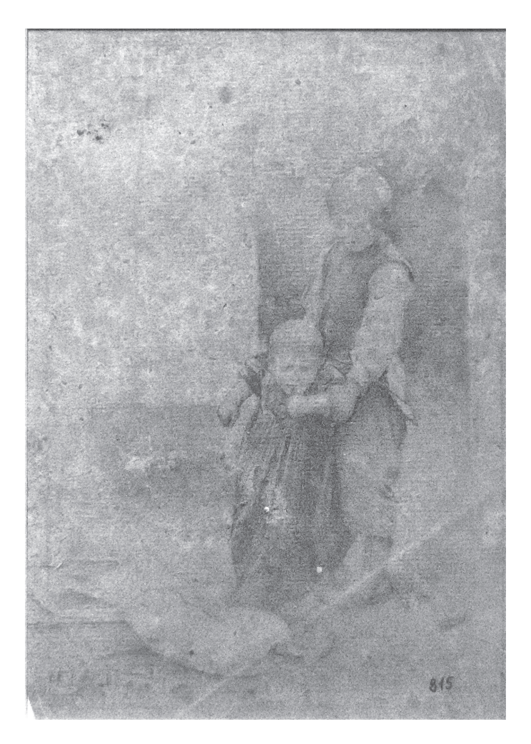
Fig. 1. Alfred Wierusz-Kowalski, Rodzeństwo ["Siblings"], ca. 1872, pencil on paper, 19 x 13,5 cm, Muzeum Okręgowe w Suwałkach [Regional Museum in Suwałki]. Black and white photography. Sketch of the painting Krowy na łące ["Cows on the grass"], undated, oil on canvas, 66,5 x 93,5cm, private collection abroad, sold in Germany in 2006.