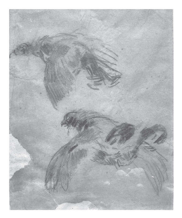
Fig. 4. Alfred Wierusz-Kowalski, Cietrzewie na toku ["Black grouses' lek"], ca. 1880, pencil on paper, 31 x 21,5 cm, Muzeum Okręgowe w Suwałkach. Black and white photo. Sketches of the painting called Na polo waniu ["Hunting"].