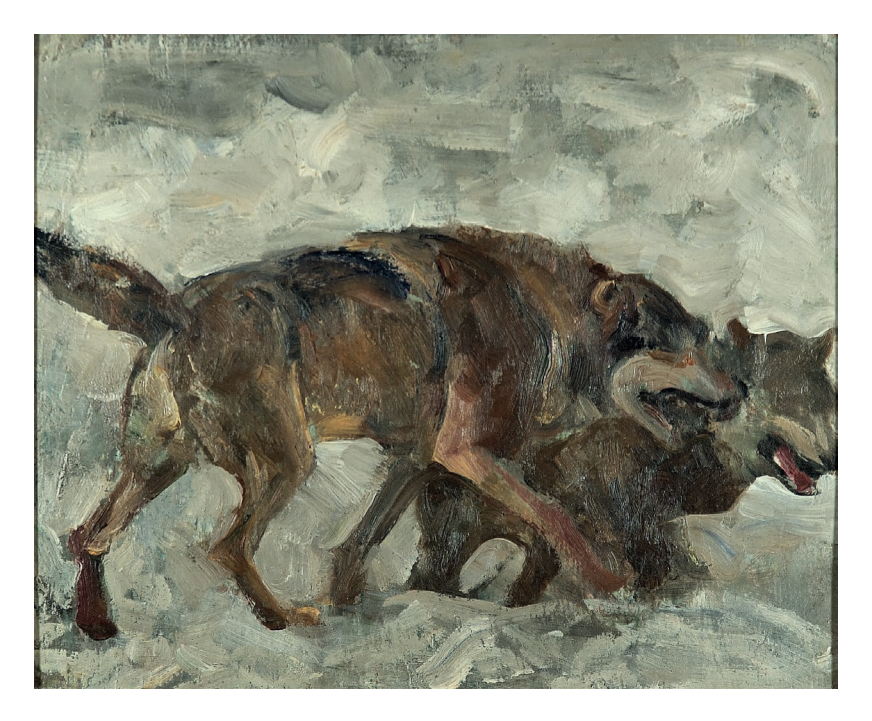
Fig. 9. Alfred Wierusz-Kowalski, Dwa wilki ["Two wolves"], ca. 1910, oil on cardboard, 25 x 31 cm, Muzeum Okręgowe w Suwałkach.