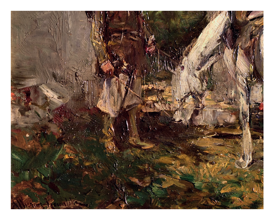
Fig. 15. Alfred Wierusz-Kowalski, Postój powstańca ["Insurgent resting"], ca. 1892–1895, oil on panel, 20 x 35 cm, fragment, Muzeum Okręgowe w Suwałkach, a gift of the artist's family. Noticeable brown underpainting in the preliminary study as well as distinguished work with a brush and spatula.