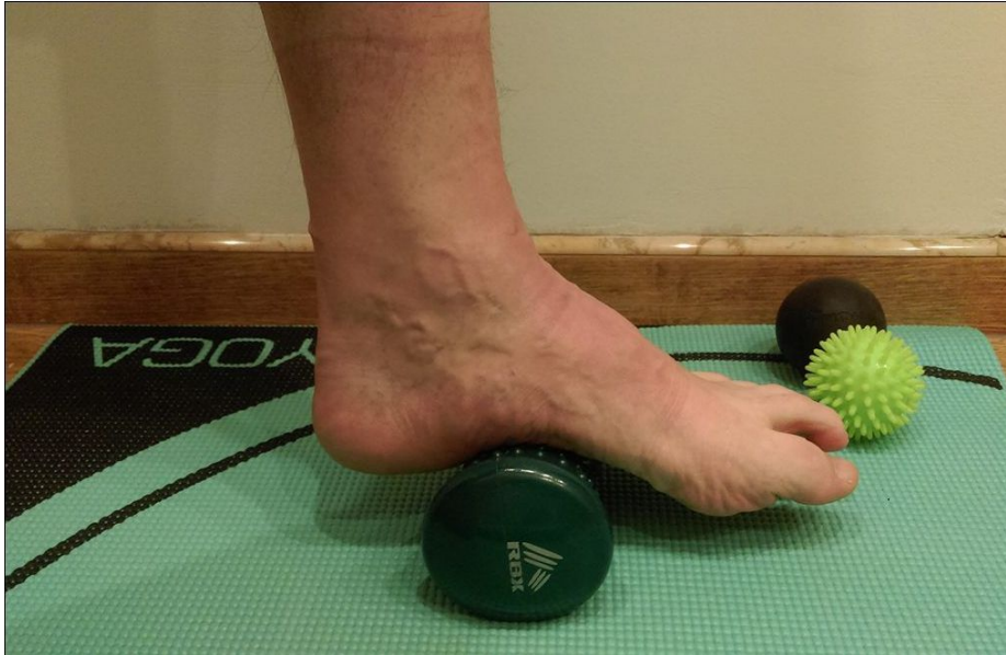
Fig. 1. Self-therapy technique using a furling.