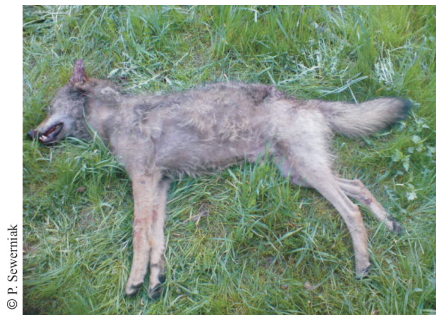
Figure 6. A young wolf killed by a car near Ołtoczyn on a road number 1 (14.05.2009)

There are two areas of primary significance for the occurrence of the present-day pack of wolves that populate the Bydgoszcz Primeval Forest. The first is a huge post-fire area, located mainly in the Cierpiszewo Forest Divi-