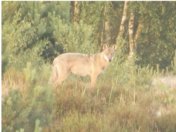
Figure 2. An adult wolf (probably one of a dominant pair in a pack of the Bydgoszcz Primeval Forest)