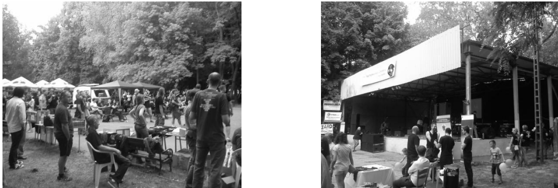
Fig. 1 Audience and stage of the Tomasz Beksiński Progressive Rock Festival in Gniewkowo in 2014.

The first Progressive Rock Festival in Gniewkowo was organized in the summer of 2007 by the brothers Janusz and Sławomir Bożko – fans of the music genre. It was a small and local event which attracted the inhabitants of Gniewkowo and its surroundings, and it featured only two bands. The next editions were more popular: since 2011, the festival lasts two days and in 2014 it was visited by 250 people ( Figure 1 ).