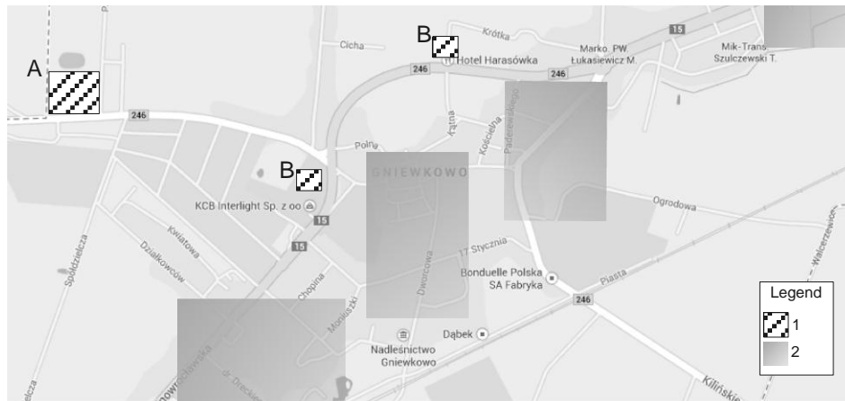
Fig. 3 The area of research in the city of Gniewkowo.

Explanation: 1 – festival sites; 2 – the area where the interviews were conducted in companies in Gniewkowo; A- Liberty Park (amphitheatre); B- accommodation of the festival participants.