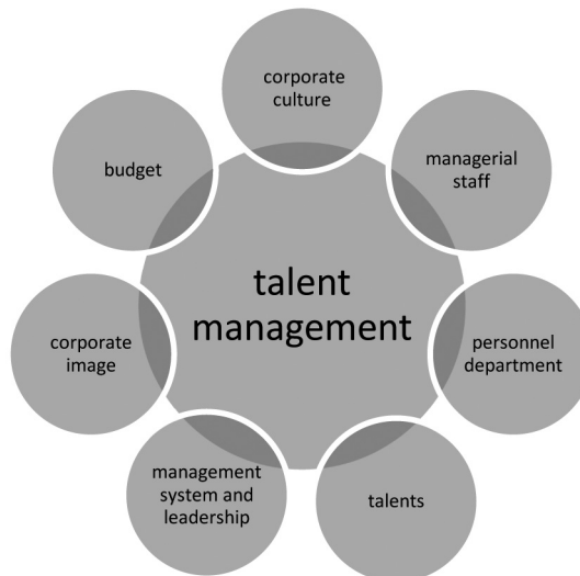
Figure 1. Internal conditions of effective talent management