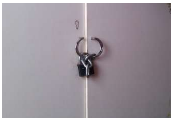
Photo 2: The Padlock with a Chain on the Doors to the Closet in the Little Living Room