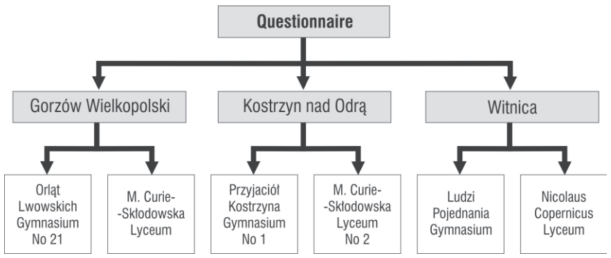
Figure 1. The names and location of schools selected for the survey.

From each of these cities one middle school (gymnasium) and one high school (lyceum) were selected to the survey, and after the interview students from two classes in each school were tested ( Figure 1 ).