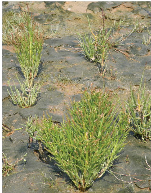
Figure 4. Salicornia europaea growing in the pioneer zone (site B)

As described above, specific environmental relationships in the studied coastal lagoons play a fundamental role in the occurrence of common glasswort and also other halophilous plants (Fig. 3). Salicornia europaea was present in the first pioneer vegetation zone next to the sea water table (Fig. 4). This plant was also found growing mostly in small flat depressions (site B), where the water stagnates longer than in adjacent areas. During the June–July–August more than 5 times the Salicornia europaea – sites are under the water during several days. Salicornia europaea was accompanied by Spergularia salina , Glaux maritima , Plantago maritima and Puccinellia maritima . Total vegetation cover in this zone not exceed 5%. The next zone – salt marsh meadows were dominated by Juncus gerardi but the patches with Salicornia europaea were present there as well. The total vegetation cover in this patches was ca. 30–40% and Salicornia europaea was assessed as abundant with cover 5–10% (1–2 in Braun-Blanquet scale). In the Salicornia europaea patches Suaeda maritima , Halimone pedunculata , Plantago maritima , Puccinellia maritima , Spergularia salina and Juncus gerardi were noted.