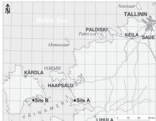
Figure 1. Location of the study sites

The study sites were characterized by the occurrence of surface bipartite deposits consisted of marine sediments overlaying moraine till. Results of grain-size distribution analyses allowed to determine the thickness of the marine sediments. It ranged from 5 to 23 cm in Põgari-Sassi and from 29 to 47 cm in Kassari, clearly increasing towards the bay. The terrain was flat with very slight inclination towards the sea basin, which was very shallow. For example, in site B water depth in the distance of 600 m from the shoreline was only 55 cm. It suggested that there was a lodgment till in the base (Kalm & Kadastik 2001). Fig-