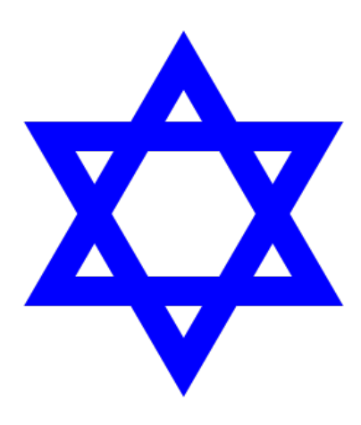
Zdjęcie 6. Gwiazda Dawida