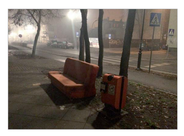
Mickiewicza Street - March

The pictures show that the main street of the district, Mickiewicza, due to a few processes taking place in its area (as far as it's public sphere), may have a negative impact on the sense of security of its inhabitants.