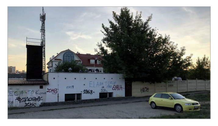
A passage towards "Piekarskie Góry"

It is hard to imagine that the avenues in the parks were illuminated as well as promenades in city centres; however, the lack of lighting coupled with the absence of a police station contributes to the fact that the parks located in Bydgoskie Przedmieście are judged by its inhabitants as dangerous, especially during autumn and winter. The question arises: is it worthwhile to endow the neighbourhood without a police station with one such station? What follows from the research is that 67% of the respondents are in favour of setting up a police station there – 36% of the respondents emphasized their frank acknowledgement by choosing the answer 'definitely yes' and 31% of them answered 'yes', In the inhabitants' opinion, there is a need for a police station – among others – in the cases calling for quick intervention and when it comes to the general order in the streets. However, 30% of the respondents believe that a police station is not needed and