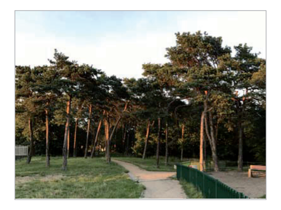
The fragment of "Piekarskie Góry" - at 19:00 in June