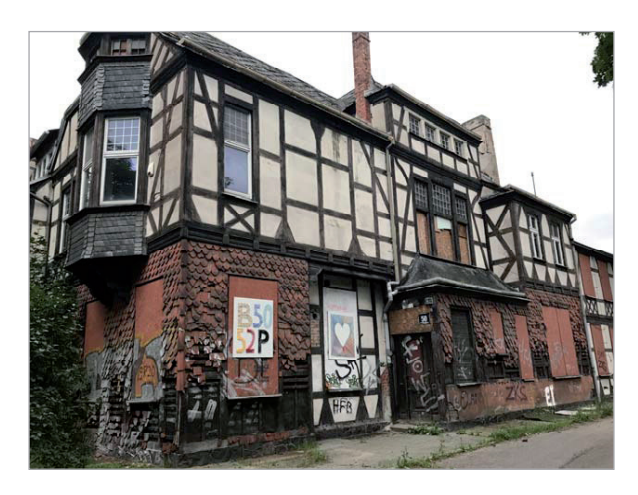
The building at Bydgoska 50 - the picture taken in May

Apart from lighting, what contributes to the sense of insecurity is devastated environment, derelict tenant houses or the visible signs of vandalism. Devastated space fits the theory of broken windows. Conspicuous lack of responsibility for certain buildings, at least on the part of a private owner and also on the part of self-government makes a given house, fence or a small architecture get damaged by vandals. In the area of the scrutinized district, these places are located in the streets indicated by the inhabitants in the survey. At Bydgoska 50, there is a historical building getting damaged. Despite the attempts to endow the place with a new useful character, after the eviction of the inhabitants, the building got clearly degraded month by month. Such buildings are plentiful in the area of the district.