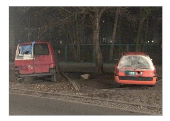
Cars parked on Mickiewicza Street - March

the environment and hence to the decreased sense of security on the part of the inhabitants.