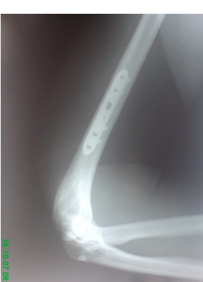
Fig.1 19 years old patient with spiral 1/3 distal humerus bone fracture.

Ryc.1 19-letni chory ze złamaniem spiralnym 1/3 dalszej kości ramiennej prawej.