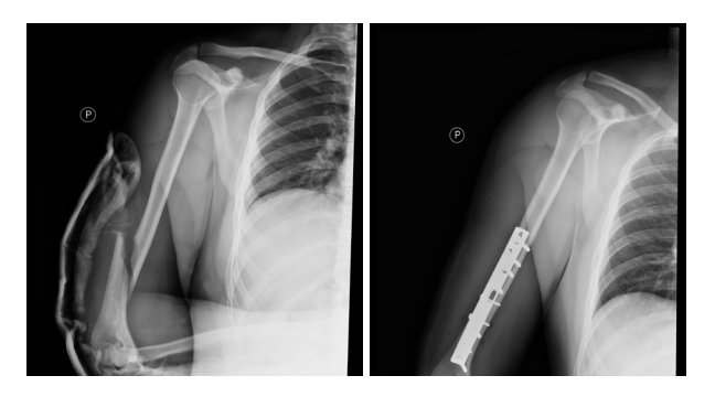
Fig 2 28-years old patient with spiral humerus fracture

Ryc.1 19-letni chory ze złamaniem spiralnym 1/3 dalszej kości ramiennej prawej.