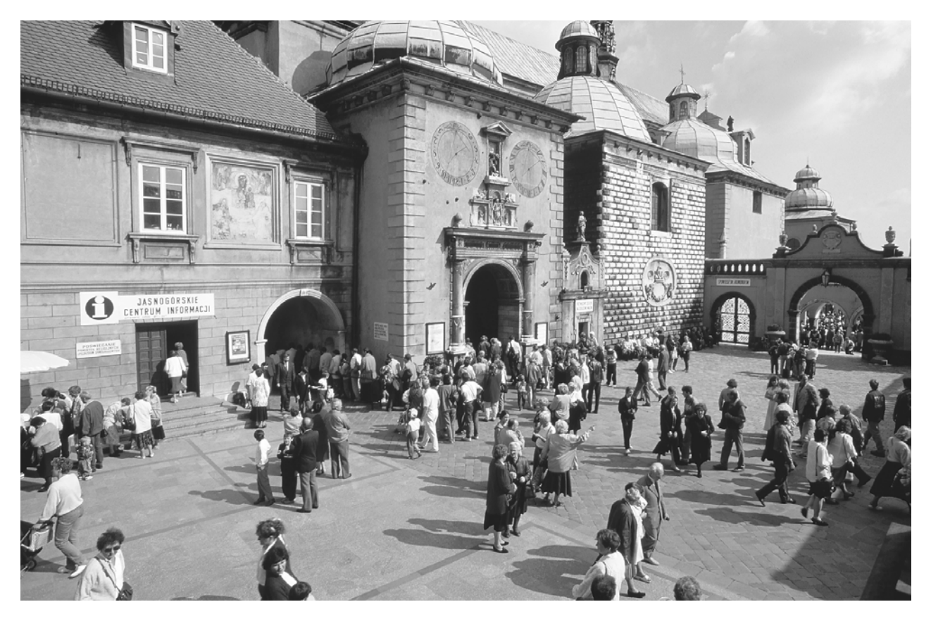
One of the best known Catholic shrines in Poland is the Marian shrine of Jasna Góra in the city of Czestochowa. It is recognized as the spiritual heart of the country and is treated as the national shrine.